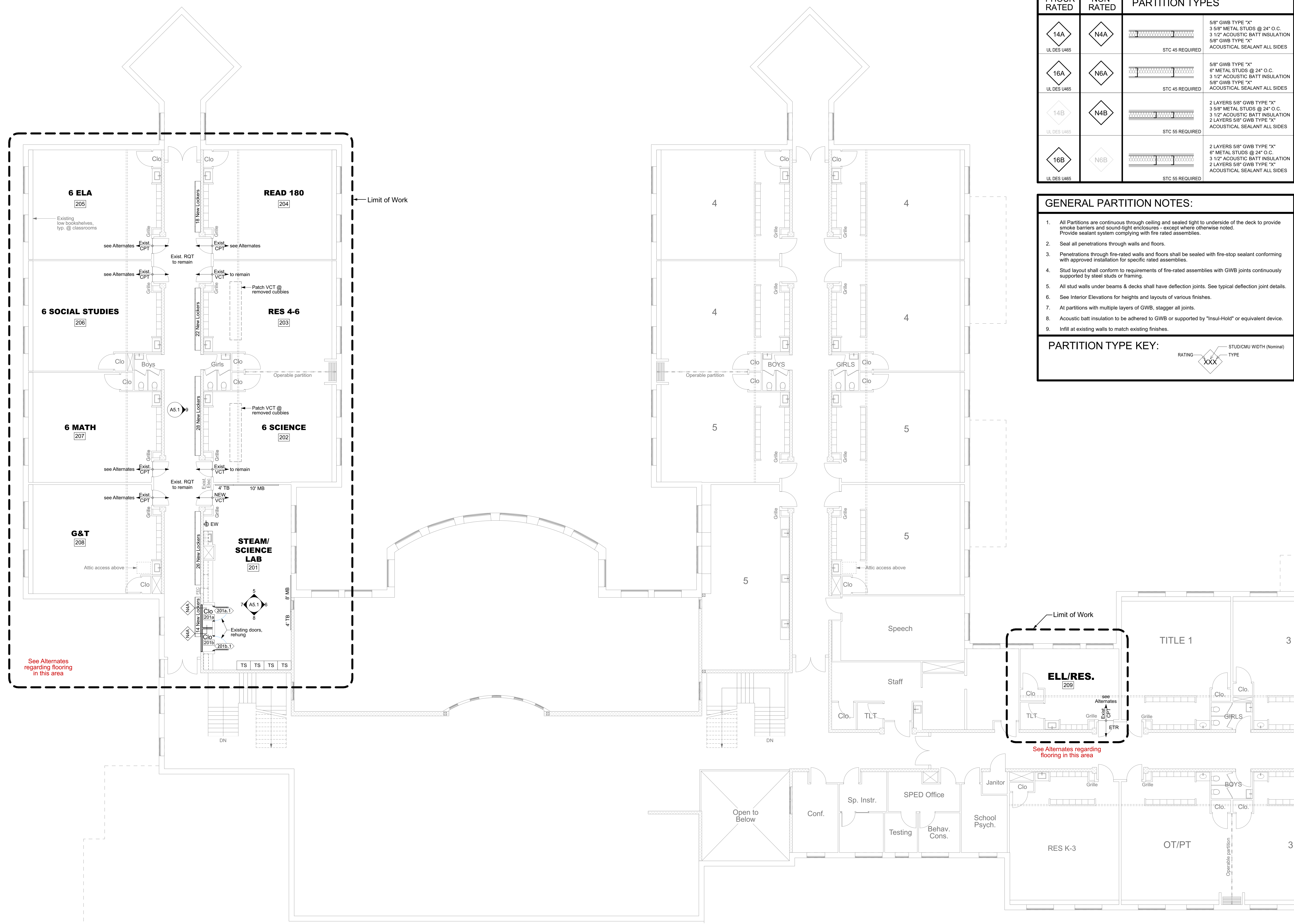
1 A1.2 Second Floor (Partial) SCALE: 1/8" = 1'-0"